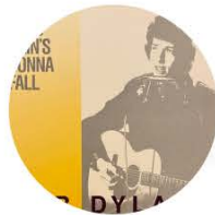
A Hard Rain's A-Gonna Fall Bob Dylan