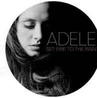
Set Fire To The Rain Adele