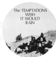
I Wish It Would Rain The Temptations'