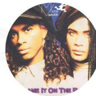
Blame It On The Rain Milli Vanilli