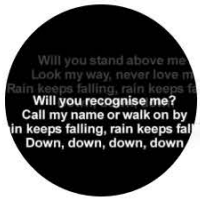
Don't You (Forget About Me) Simple Minds