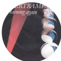
It's Raining Again Supertramp