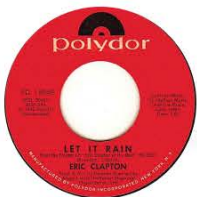
Let it Rain Eric Clapton