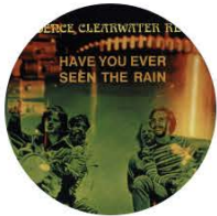
Have You Ever Seen The Rain Creedence Clearwater