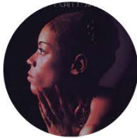
I Can't Stand the Rain Ann Peebles