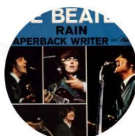
Rain The Beatles