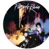
Purple Rain Prince